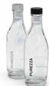
PETALOSA BOTTLES 350/750 ml

Our exquisite and unique range of glass bottles has been meticulously designed with the busy hospitality environment in mind. In both function and form, our bottles provide the ultimate in hygiene requirements whilst simultaneously elevating the user experience for both the venue and the customer.