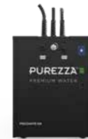
FRIZZANTE 80 BOX

Ideal for optimising space, these units are compact and robust and can fit in almost any venue. State-of-the-art technology enables high capacity dispensing of chilled, still and sparkling water. Two different towers for manual and electronic dispensing are perfect for bars, restaurants, cafes and conference centres.