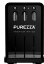
FRIZZANTE 80 ELECTRONIC