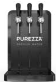
FRIZZANTE 80 MANUAL